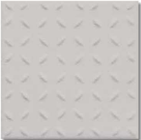
relief GRH \mu \geq 0,7

GAF... - Hladký protiskuzný povrch | Smooth slip-resistant surface GR... - Reliéfní povrch | Relief surface ABS... - Hladký protiskuzný povrch R10/B | Smooth slip-resistant surface R10/B