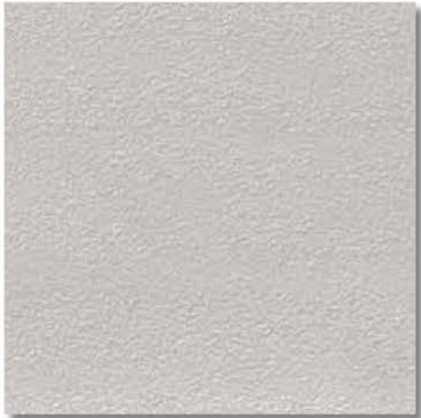
mat | matt GAF R10/B \mu \geq 0,6